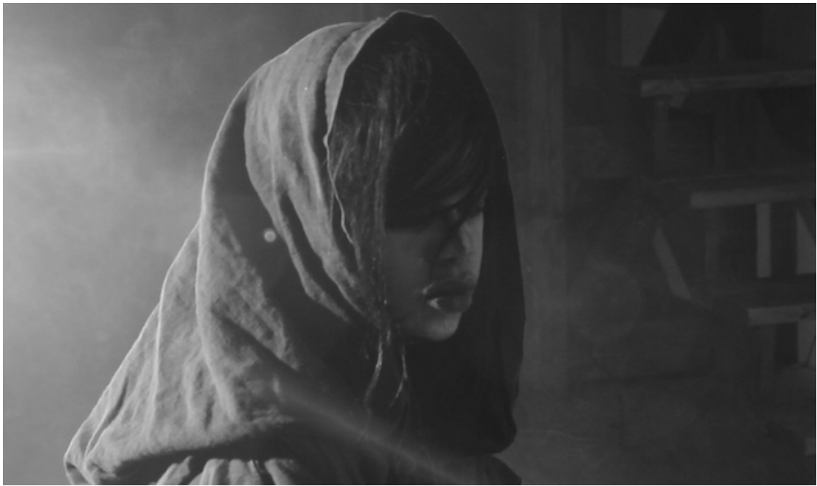
A still from 'NEGROGOTHIC: a Manifesto' | Courtesy of M. Lamar