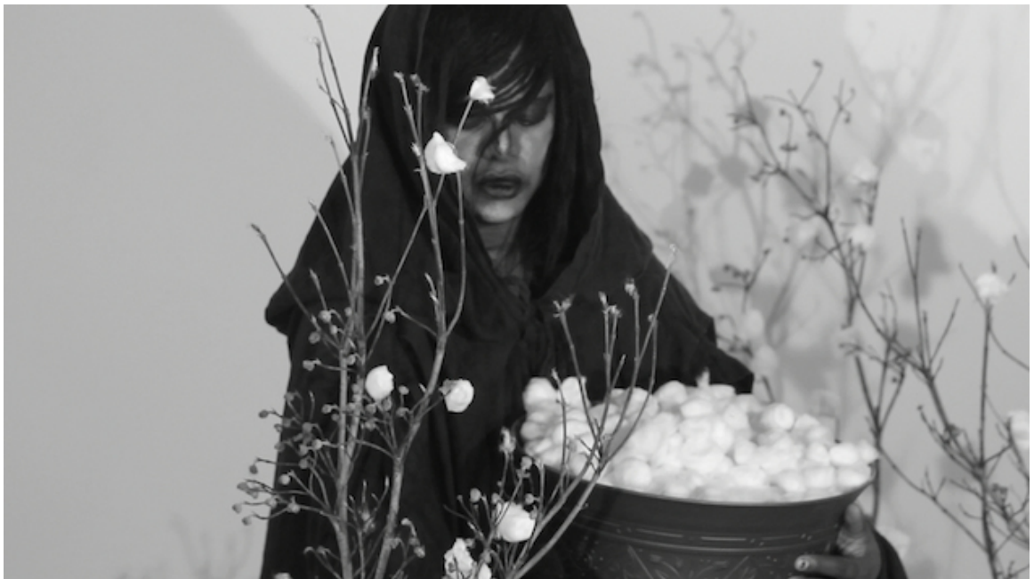
A still from 'NEGROGOTHIC: a Manifesto'

Much of his work focuses on black male sexuality, and white America's pathological fascination with it. "I'm very interested in white men and their preoccupation with certain kinds of stereotypes about black men and black men's genitalia," Lamar tells me. This interest isn't limited to gay men, Lamar points out—just look at all the white guys directing "big black dick" straight porn. In his music, Lamar turns the lens around, and looks at white people looking at black people. In so doing, he makes obvious the distance between the real lives of black men and the narrow ways in which they are portrayed in the mainstream (white) imagination.