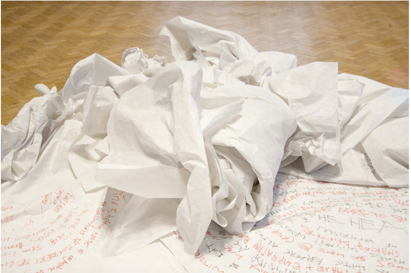
Ron Athey, Gifts of the Spirit: Automatic Writing , Whitworth Hall, Manchester, 27 June 2011.

Ron Athey Gifts of the Spirit: Automatic Writing Automatic Writing Workshop July 23-27, 2013 For participants only, see enclosed call for applicants