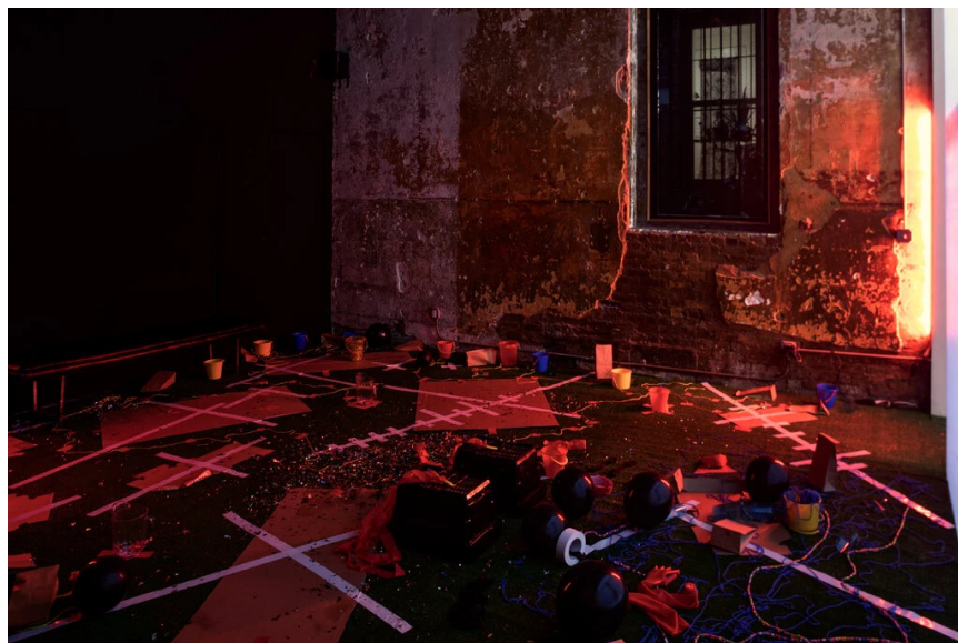
“Middle Passage: After the Party,” which traces a path from subjugation to emancipation.