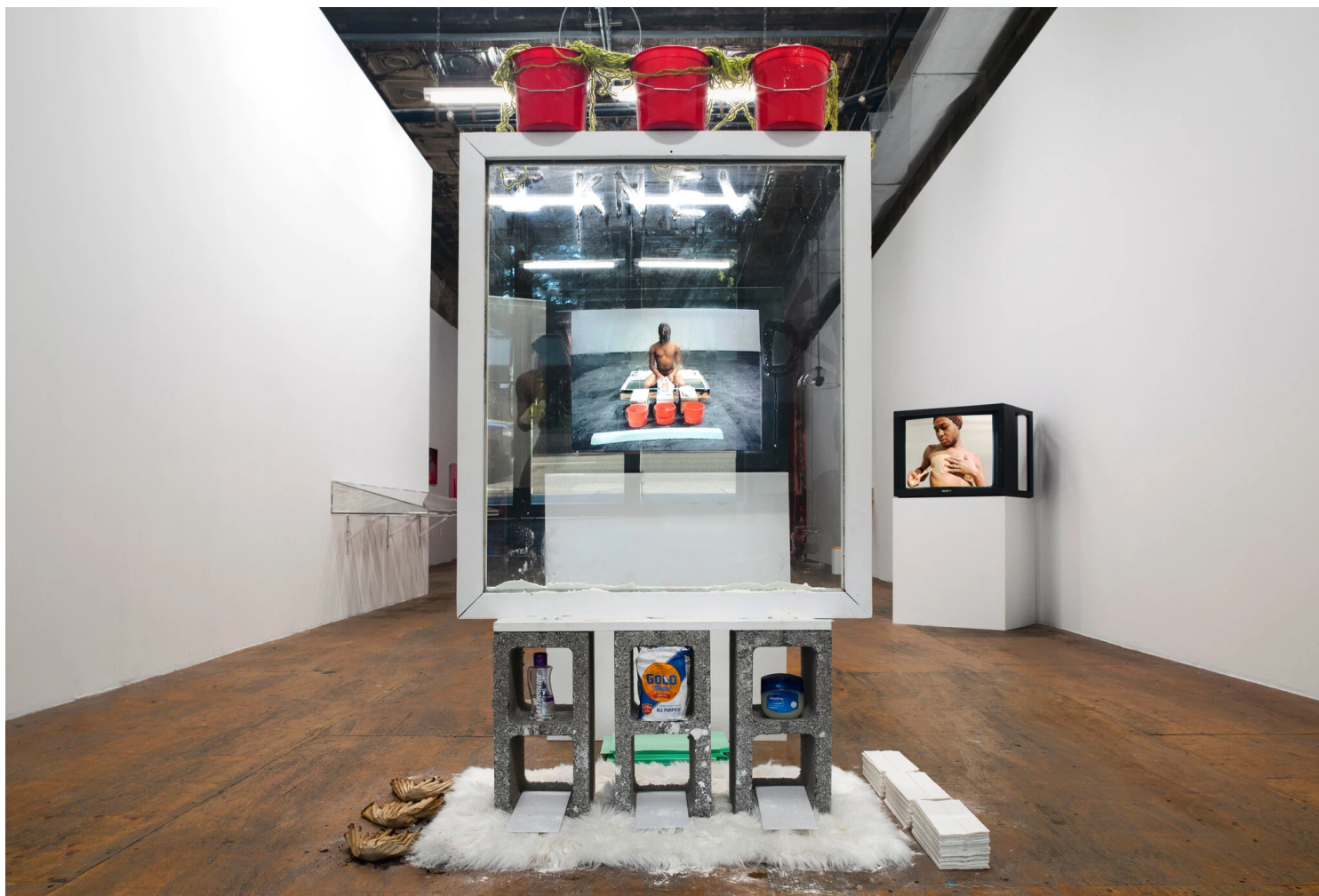
“Window View: Covered in Lube.” Loaded symbols like flour highlight the materiality of our economy and its dependence on disposable labor. Daniel Kukla

Step into Participant Inc. and the first thing that greets you is silence. “The Poetics of Trespassing” contains three videos, originally performed as one piece and later filmed for camera. They play without audio on three Sony box monitors.