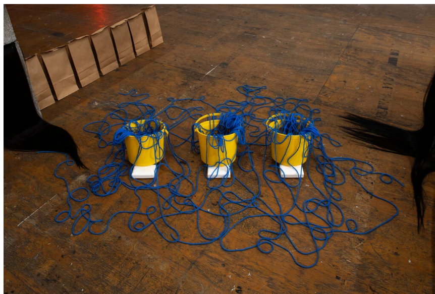
“Hair Line Towers: Hang Me Out to Dry,” which references the caretaking work that Black women and femmes often take on.